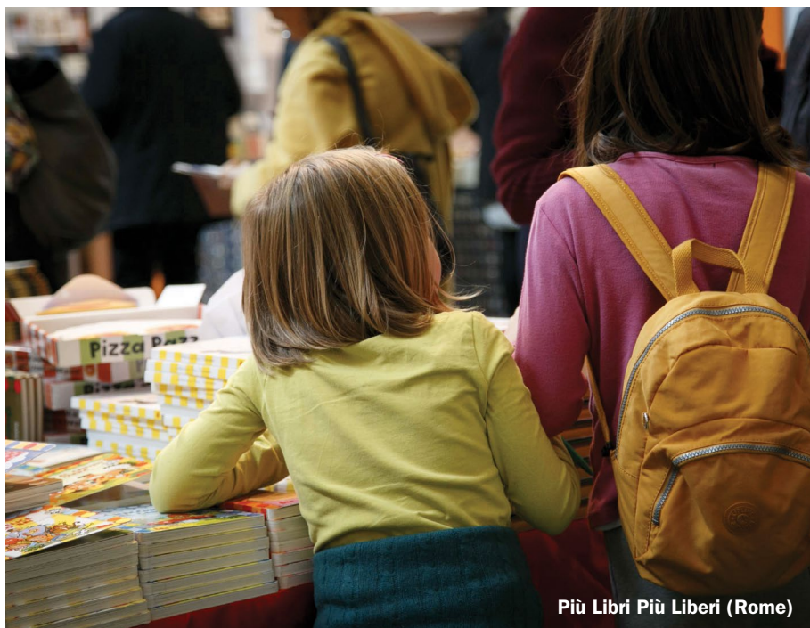
Più Libri Più Liberi (Rome)