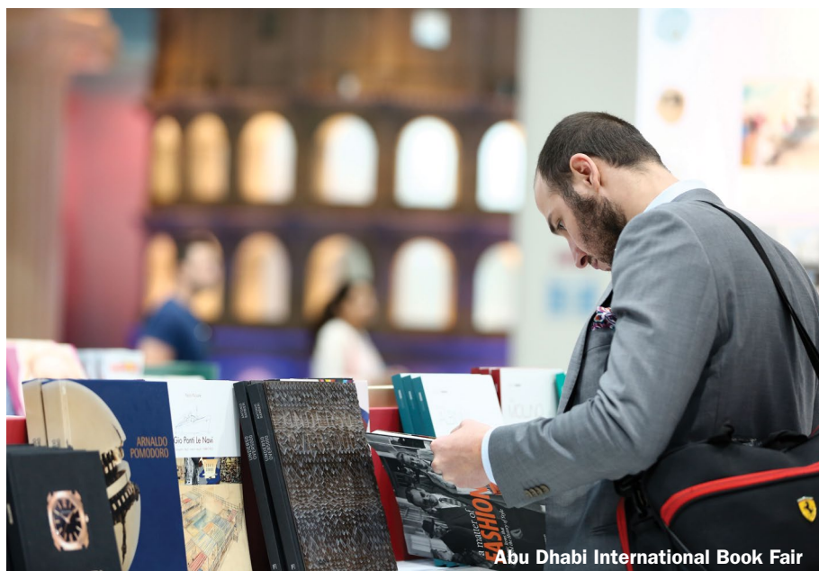
Abu Dhabi International Book Fair

Company Profile: the only Italian bookstore in the Netherlands, founded in 1977. It imports directly from Italy. Books almost exclusively by Italian authors and Dutch books translated into Italian. Books for learning Italian, easy readers, Italian fiction, classics, poetry, comics, history and current events, books for